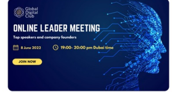
GLOBAL DIGITAL SHOW TODAY ON